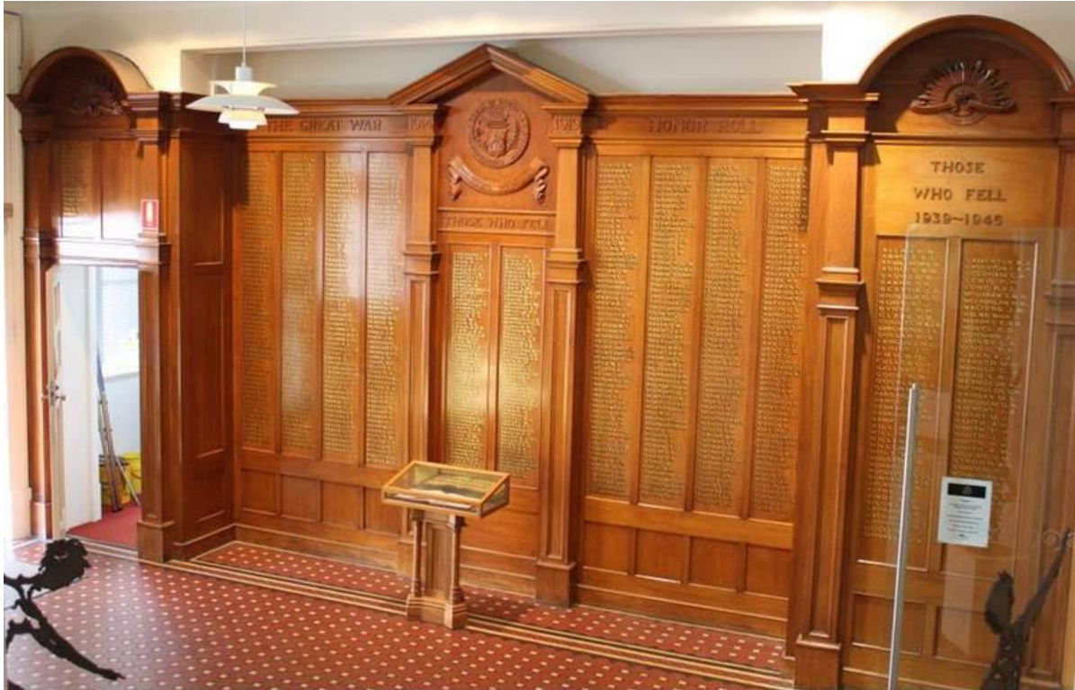
Glenelg Honour Board