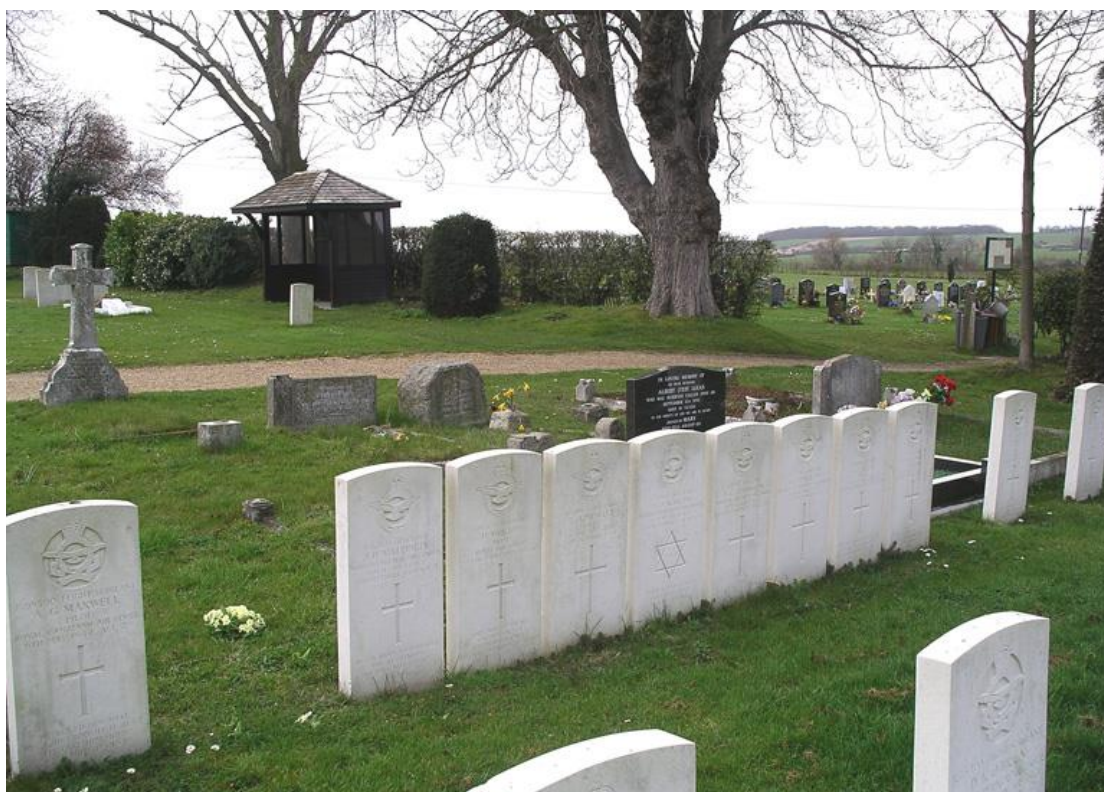
Kempston Cemetery, Bedfordshire

There is only one Australian burial in Kempston Cemetery.