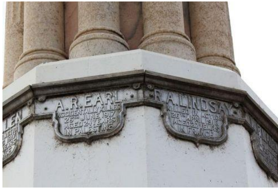
Example of the names